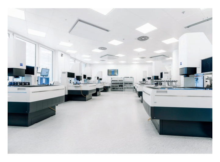
The Gerresheimer test lab: large-scale production, top-level measurement capacity.

Keen to further the performance of its optical and tactile systems, implement even more efficient measurement programs, and cut its measuring times by around 50%, the pharmaceutical product manufacturer Gerresheimer AG has formed an intensive partnership with ZEISS. This fruitful collabration has secured a string of benefits for both parties. It has also inspired numerous innovations, such as the development of new hardware and software as well as software optimizations within ZEISS CALYPSO and the operating system.